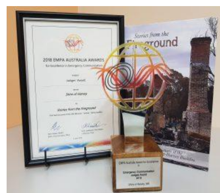
Stories from the Fireground awarded the Special Judges Award at the EMPA Emergency Communication Awards

Copies of the book are available for purchase for $30 each from the Yarloop Community Resource Centre and if you just want to have a flick through, there is also one on display. For further information on the book and how to purchase a copy, contact the Shire of Harvey on 9729 0300.