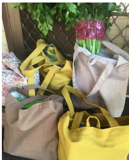
The CWA Boomerang Bags in Action

use of resources". These bags are made from fabrics which would otherwise have been thrown away or sit in a cupboard for years. There are heavy duty and light weight bags, depending on what you intend to put in them. When available, they can be purchased from CWA members for a donation (depending on size). We are just waiting on some iron labels and they will be ready for sale. Look out for our members selling them in the near future.