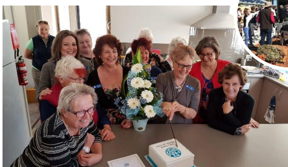
Yarloop ladies cutting cake for the 80 th Birthday of their Yarloop Branch.

The nomination for Yarloop Country Womens' Association CWA has made it to the Semi-Finals in the Woolworths Community Group of the Year Award which forms part of the 2018 Western Australian Regional Achievement and Community Awards. The Awards aim to encourage, acknowledge and reward the valuable contributions that individuals, groups and businesses are making throughout rural and regional Western Australia. We will be notified if we are in the finals after 31 st August.